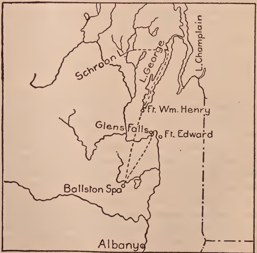
Map of Places Referred to in The Mohicans

appeared to find favor, and, all things considered, it may possibly be quite as well to let it stand, instead of going back to the house of Hanover for the appellation of our finest sheet of water. We relieve our conscience by the confession, at all events, leaving it to exercise its authority as it may see fit.